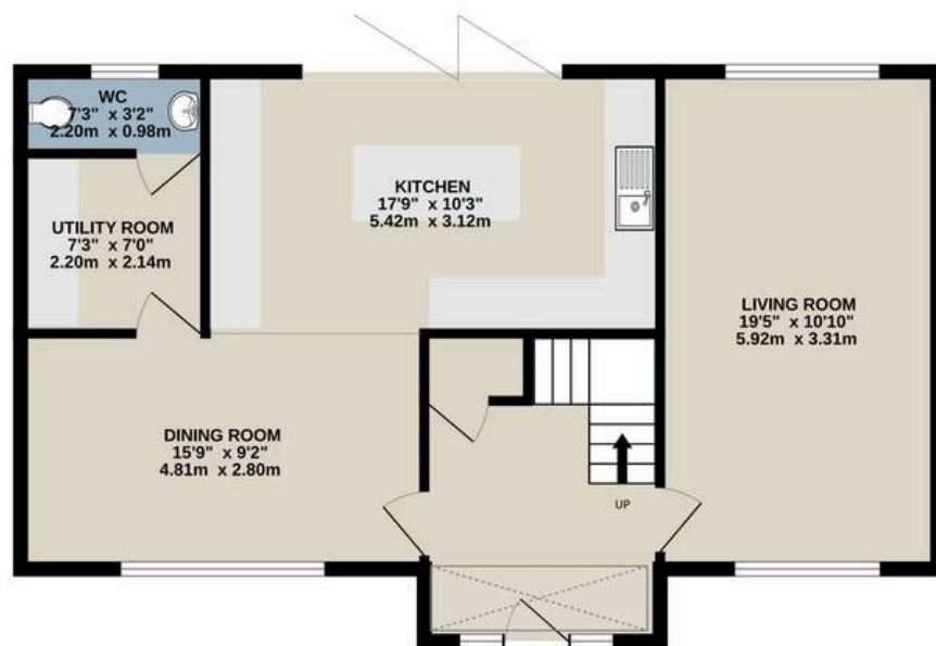
GROUND FLOOR 722 sq.ft. (67.1 sq.m.) approx.